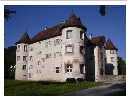
Wasserschloss in Glatt