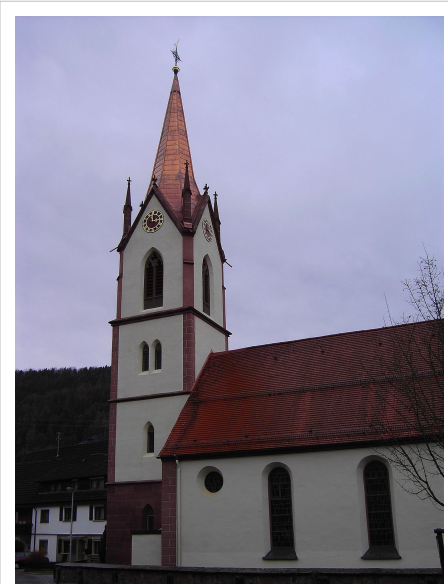
Kirche Sankt Gallus in Glatt (Sulz am Neckar)